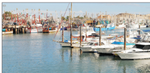
Marty Hope, Calgary Herald

Baja California, itself, is actually one of the longest, most isolated peninsulas in the world, second only to the Malay Peninsula in Southeast Asia. The Gulf of California is a UNESCO World Heritage Site.