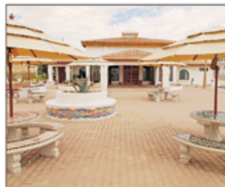
This building near the central pool will hold an owners' lounge and spa.

While the Sea of Cortez is the star attraction of the community, a main