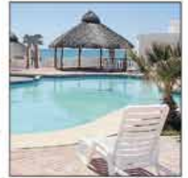
A pool area at the project.