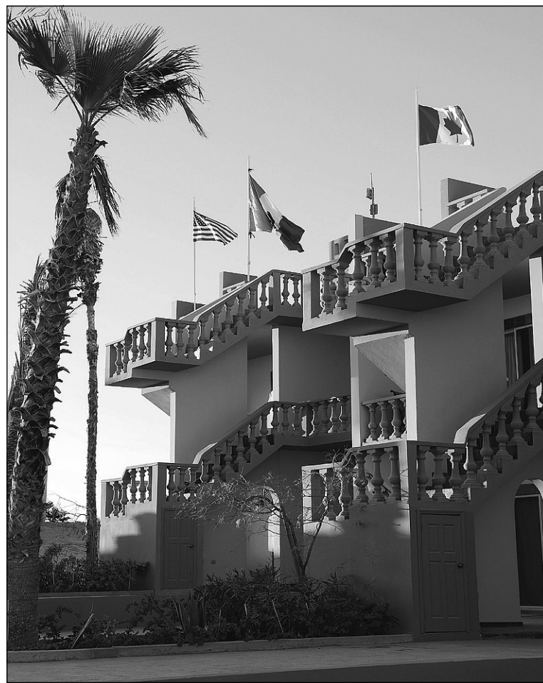
A Canadian flag flies from the exterior of villas within the project.

ful. It’s like bath water down there. You don’t have to worry about the cold water.”