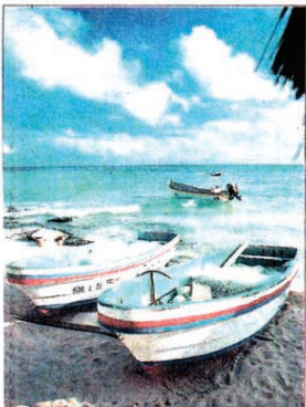
WASHINGTON POST Playa del Carmen, Mexico